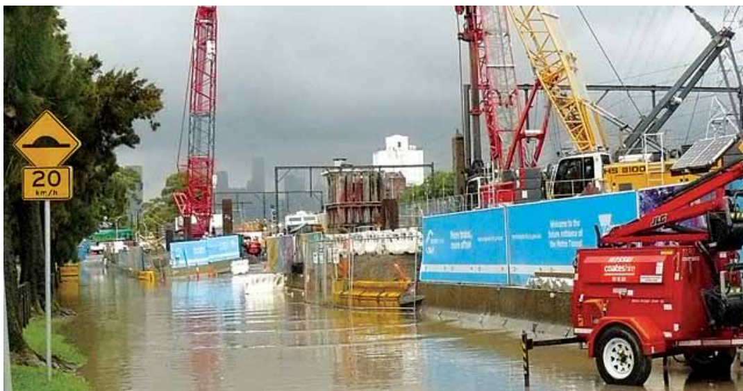
Work goes on at the Metro Tunnel entrance in South Kensington despite the rain.