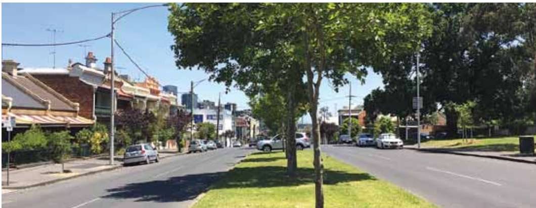
Hawke Street, West Melbourne.