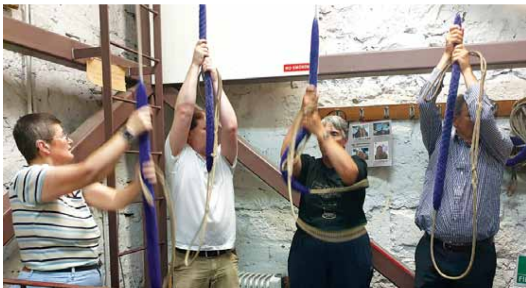
Bellringers at St James Old Cathedral.