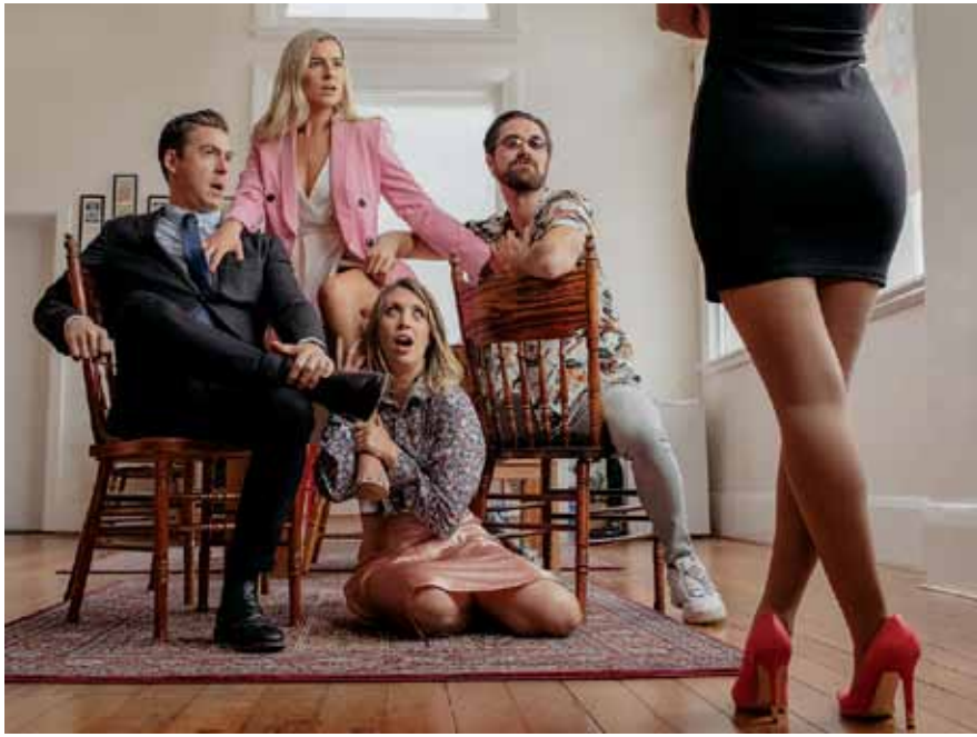
Four of the play's characters (Noah, Valorie, Angelo and Sara) face the fifth, call girl Jasmine.

Chairs lined the room's four walls, surrounding