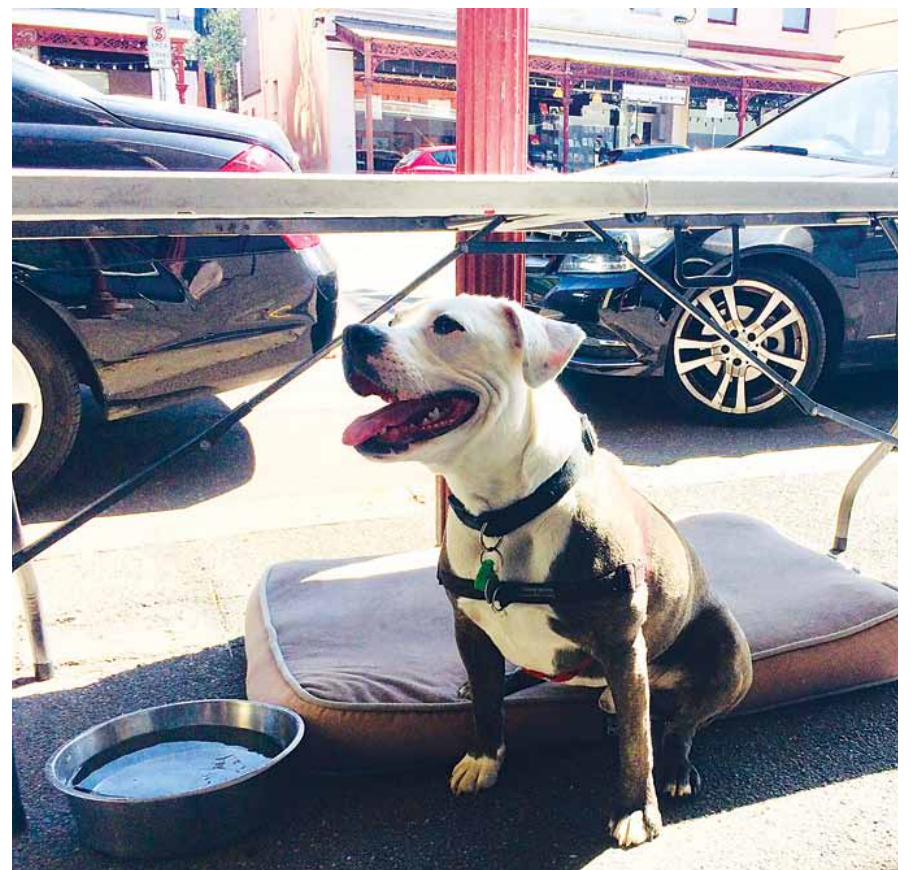
Max takes it easy outside Ace Antiques.